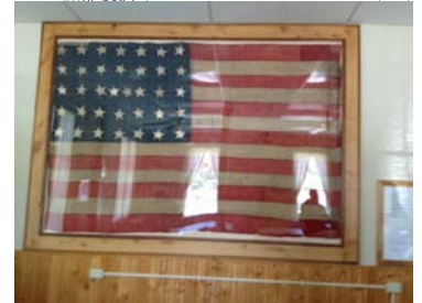
Historic 1800s flag at Texas Lodge #46.