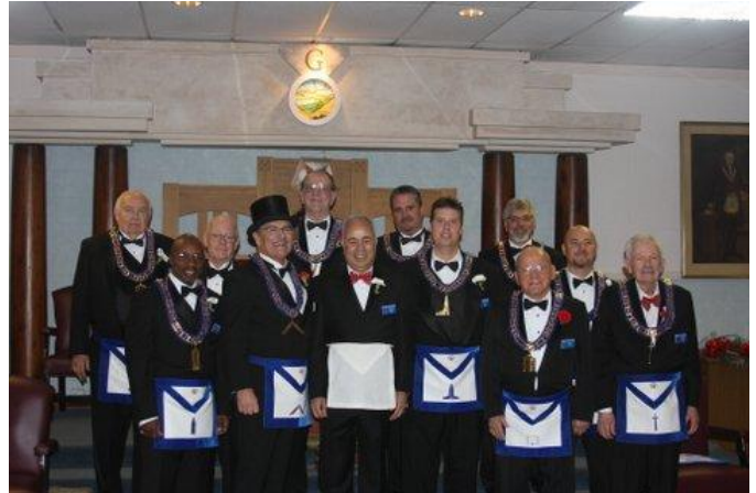
Orinda Installed Officers for 2014