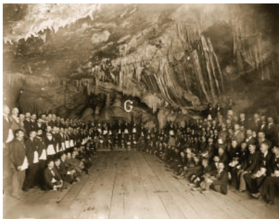
The Masonic Grand Lodge of Arizona meeting in a cave in the mine of the copper queen consolidated mining co. at Bisbee, Arizona on Nov. 12, 1897.