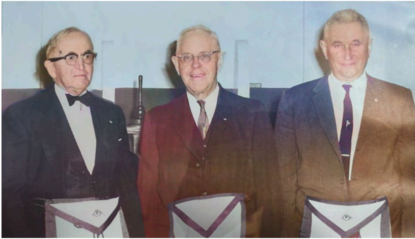
The originators of the long standing visitations!